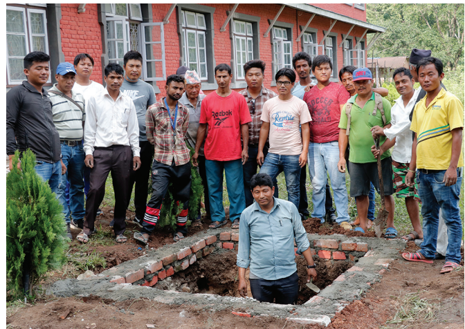
Picture 2: Recharge pit demonstration in the premises of Dharan Submetropolitan city

For instance, as a climate adaptive water management strategy, 1.5m 3 (1m x 1m x 1.5m) recharge pits were constructed at household level in Dharan Sub-metropolitan city. In Dhulikhel, 24 recharge ponds of 259.07 m 3 were constructed at community level. These pits/ponds are expected to contribute ground water recharge and reduce surface run-off. Although rainwater harvesting is an old practice, CAEWMPs also include social mobilization and engagement of policy makers. Based on the average rainfall and soil type, it is estimated that a recharge pit can infiltrate 4,256 liter water and recharge ponds can infiltrate 303,496 liter water per year. This estimate assumes that 25%-75% water can be infiltrated based on the rainfall intensity above 25 mm.