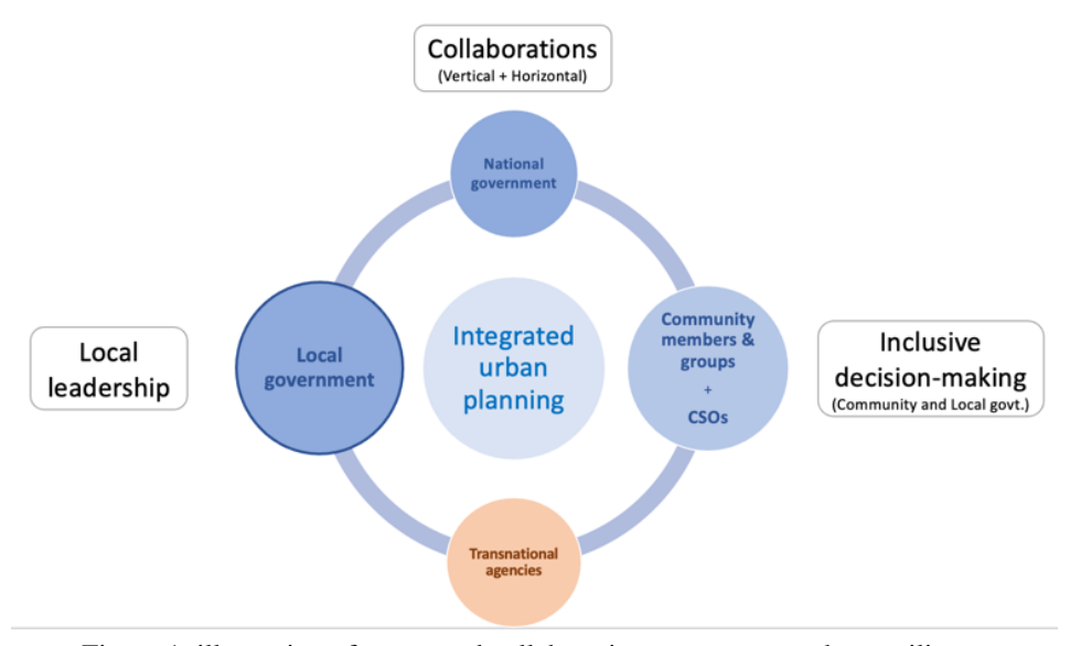
Figure 1: illustration of actors and collaborations to promote urban resilience

With respect to horizontal coordination, the national government officials felt that relevant line ministries need to coordinate with each other. While the local stakeholders felt that local governments need to engage with non-government actors such as civil societies, traditional groups ( Guthi ), youth groups and community members.