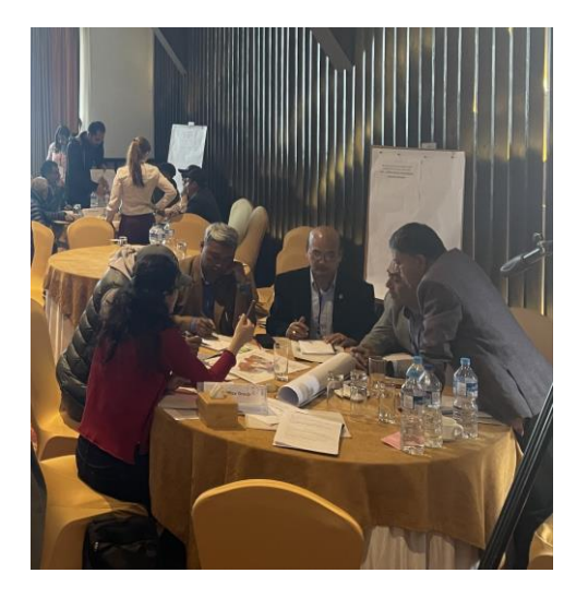
Image 1: Khokana community members at the risk agreement workshop.