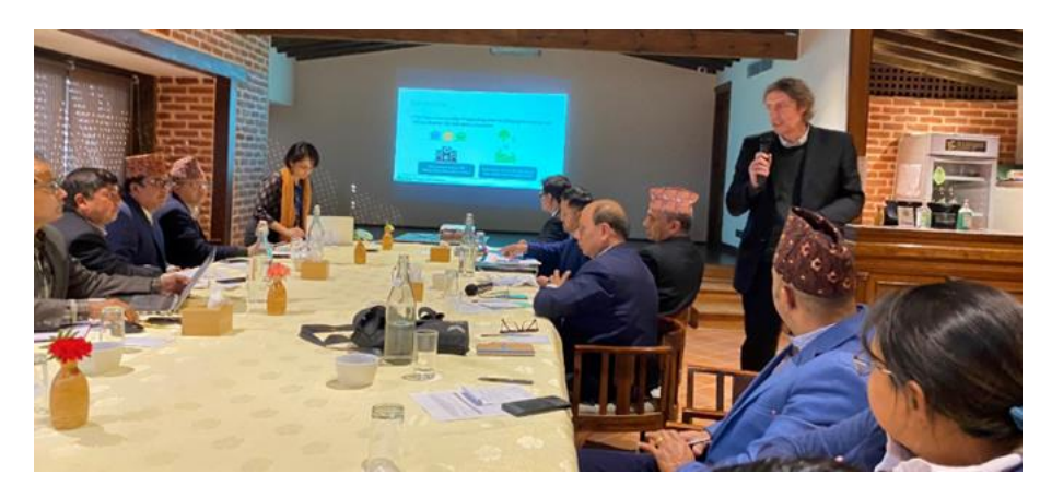
Image 2: Consultation with representatives from relevant national level ministries, Nepal